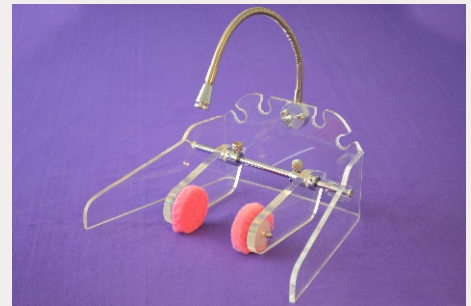
Fixing Tube by branch(Model:H270)